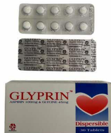
12. ASPIRIN 100MG TAB (GLYPRIN)