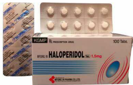
90. HALOPERIDOL 1.5MG TAB (MYUNG IN)