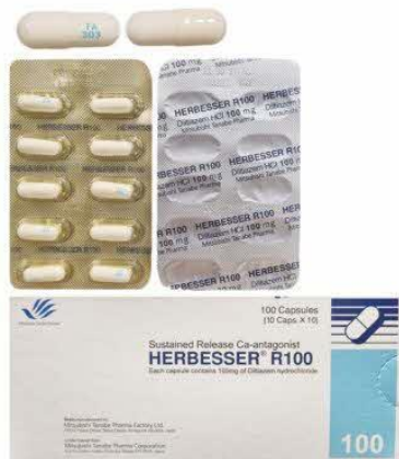
59. DILTIAZEM HCL SR 100MG CAP (HERBESSER)