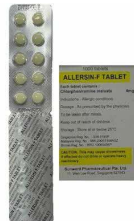
40. CHLORPHENIRAMINE 4MG TAB (ALLERSIN-F)