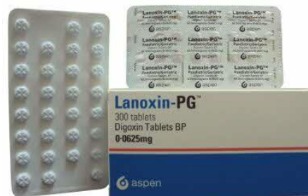
55. DIGOXIN 62.5MCG TAB (LANOXIN PG)