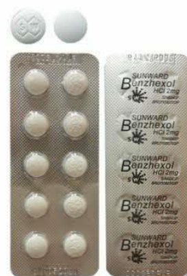
20. BENZHEXOL 2MG TAB (SUNWARD)