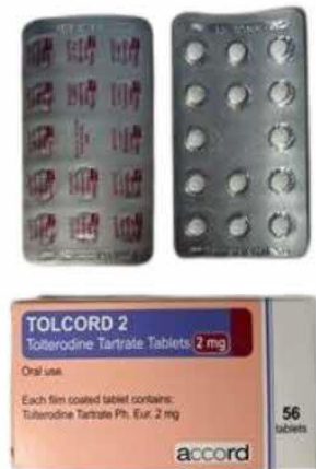
169. TOLTERODINE TART 2MG TAB (TOLCORD)