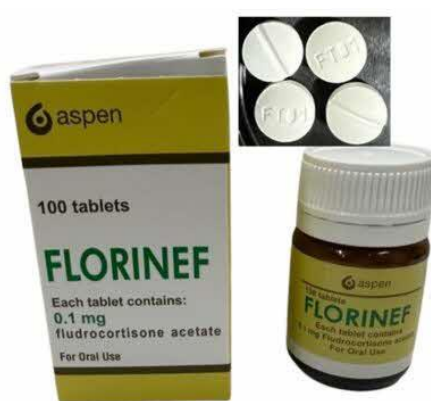
77. FLUDROCORTISONE ACET 0.1MG TAB(FLORINEF)