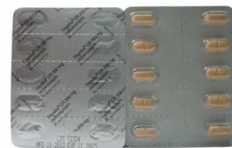
34. CARBAMAZEPINE 200MG CR TAB (TEGRETOL)