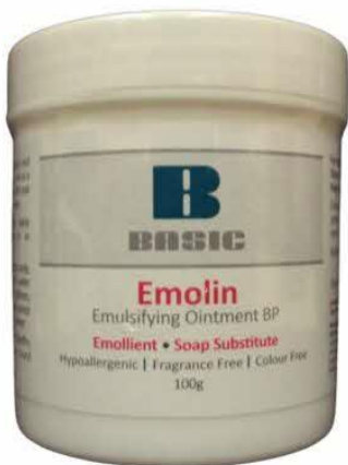
66. EMULSIFYING OINT 100G