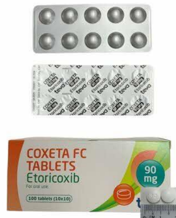
71. ETORICOXIB 90MG TAB (COXETA)