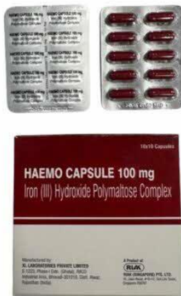
103. IRON (POLYMALTOSE) 100MG CAP.TAB (HAEMO)