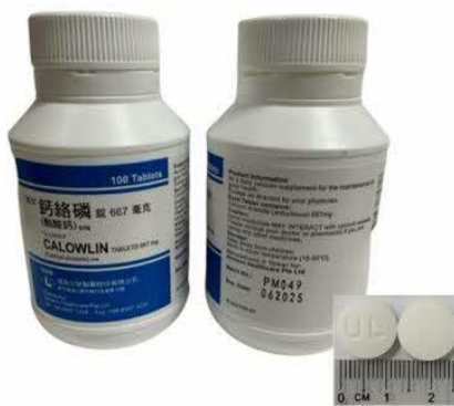
30. CALCIUM ACETATE 667MG TAB