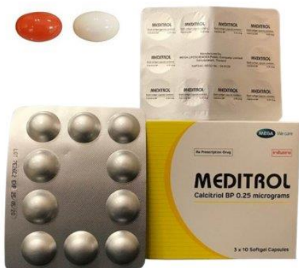
29. CALCITRIOL 0.25MCG CAP (MEDITROL)