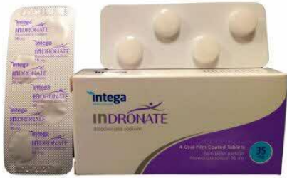
142. RISEDRONATE SOD FC 35MG TAB