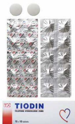
167. TICLOPIDINE HCL 250MG TAB (TIODIN)