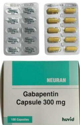
85. GABAPENTIN 300MG CAP (NEURAN)