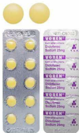
53. DICLOFENAC SODIUM 25MG EC TAB(VOREN)