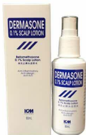
21. BETAMET VAL 0.1%SCALP LOT 80ML(DERMASONE)