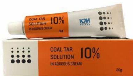
48. COAL TAR 10%, AQUEOUS CR 30G (ICM)