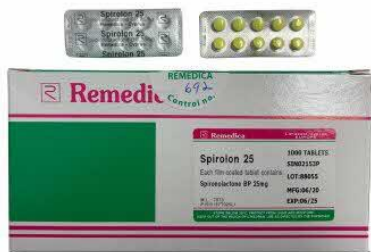
157. SPIRONOLACTONE 25MG TAB(SPIROLON 25)