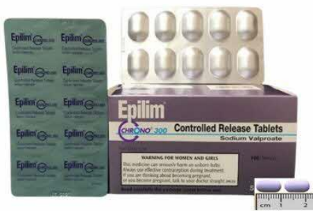
153. SOD VALPROATE 300MG CHRONO TAB (EPILIM)