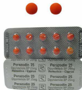
61. DIPYRIDAMOLE 25MG TAB (PERAZODIN 25)