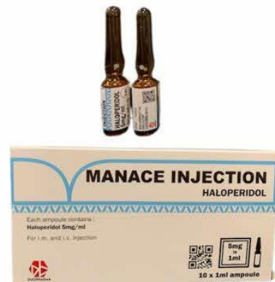
92. HALOPERIDOL 5MG.ML INJ (MANACE)