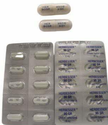
60. DILTIAZEM HCL SR 90MG CAP (HERBESSER)