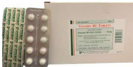
166. THIAMINE HCL 10MG TAB