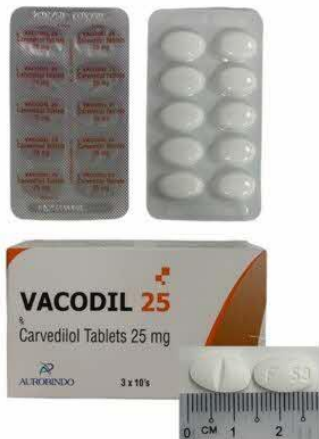
38. CARVEDILOL 25MG TAB (VACODIL)