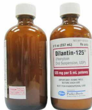
131. PHENYTOIN 125MG5ML SUSP 237ML(DILANTIN)