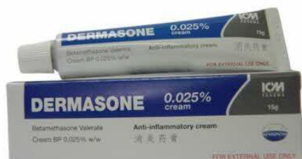
22. BETAMETHASONE VAL 0.025%CR 15G(DERMASONE)