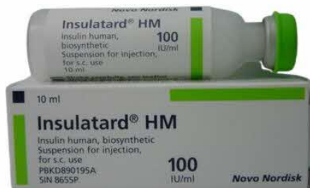
100. INSULATARD HM 1000 IU.10ML INJ