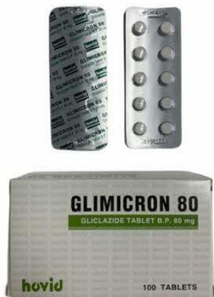
87. GLICLAZIDE 80MG TAB (GLIMICRON)