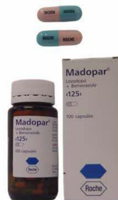
108. LEVODOPA 100MG, BENSERAZIDE 25MG CAP