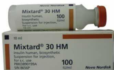
123. MIXTARD 30 HM 1,000 IU10ML INJ