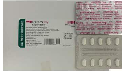
143. RISPERIDONE 1MG TAB (EPERON)