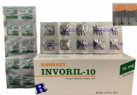
67. ENALAPRIL MALEATE 10MG TAB (INVORIL-10)