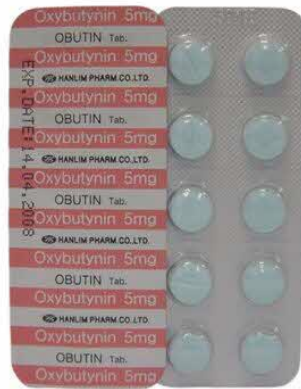
128. OXYBUTYNIN CHLORIDE 5MG TAB(OBUTIN)