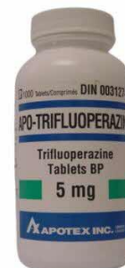
171. TRIFLUOPERAZINE HCL 5MG TABLET (APO)