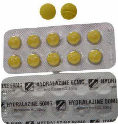
96. HYDRALAZINE HCL 50MG TAB (BEACONS)