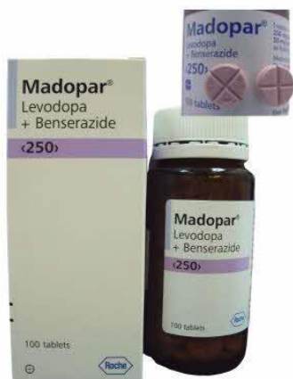
109. LEVODOPA 200MG, BENSERAZIDE 50MG TAB