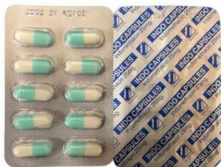
99. INDOMETACIN 25MG CAP (INDO)