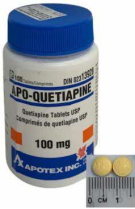
140. QUETIAPINE 100MG TAB (APO)