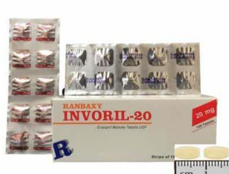
68. ENALAPRIL MALEATE 20MG TAB (INVORIL-20)