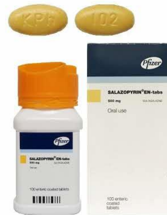
158. SULFASALAZINE 500MG EC TAB(SALAZOPYRIN EN)