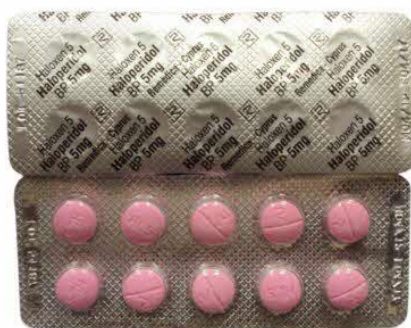
91. HALOPERIDOL 5MG TAB (HALOXEN 5)