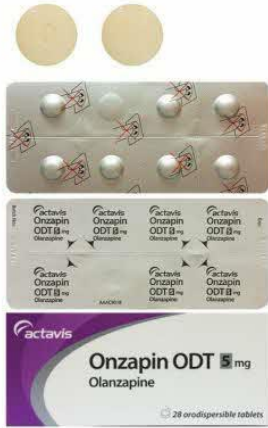
127. OLANZAPINE ODT 5MG TAB (ONZAPIN ODT)