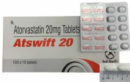
16. ATORVASTATIN 20MG TAB (ATSWIFT 20)