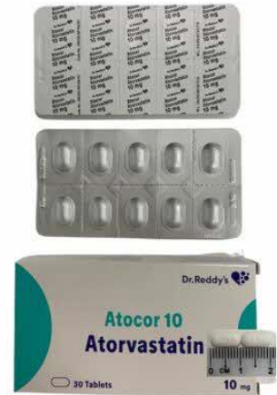
15. ATORVASTATIN 10MG TAB (ATOCOR)