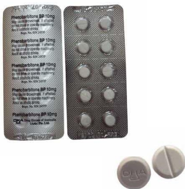
129. PHENOBARBITAL 10MG TAB (DHA)