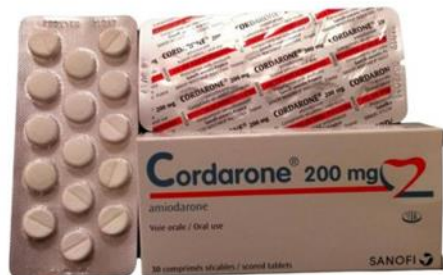
7. AMIODARONE HCL 200MG TAB (CORDARONE)