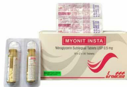
89. GLYCERYL TRINIT SL 0.5MG TAB(MYONIT)