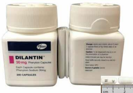
133. PHENYTOIN SOD 30MG CAP