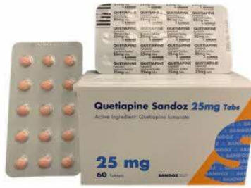
141. QUETIAPINE 25MG TAB (SANDOZ)