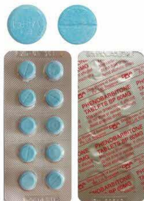
130. PHENOBARBITAL 60MG TAB (DHA)