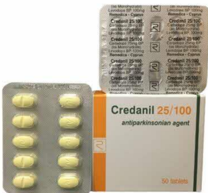
36. CARBIDOPA 25MG, LEVODOPA 100MG TAB (CREDANIL)