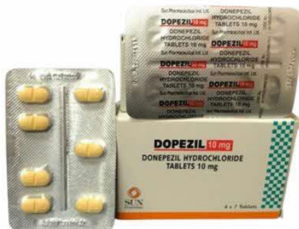
63. DONEPEZIL HCL 10MG TAB (DOPEZIL)