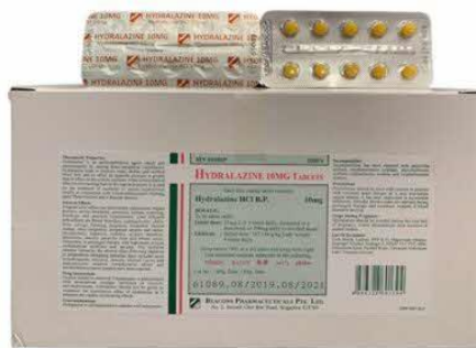
94. HYDRALAZINE HCL 10MG TAB(BEACONS)