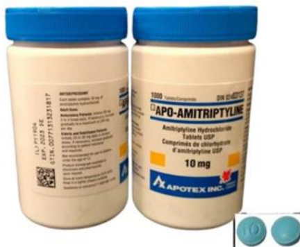
8. AMITRIPTYLINE HCL 10MG TAB(APO)