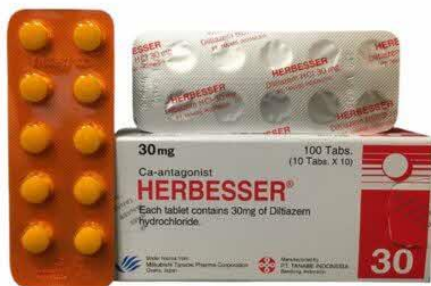
57. DILTIAZEM HCL 30MG TAB (HERBESSER)