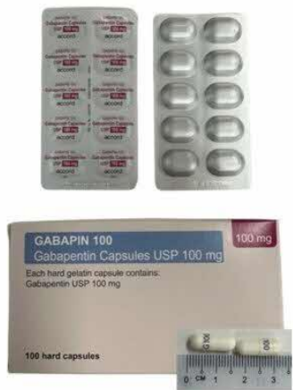
84. GABAPENTIN 100MG CAP (GABAPIN)