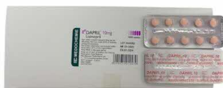
110. LISINOPRIL 10MG TAB (DAPRIL 10)