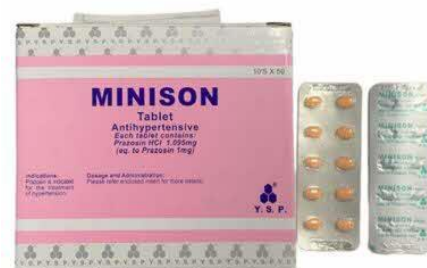
134. PRAZOSIN HCL 1MG TAB (MINISON)