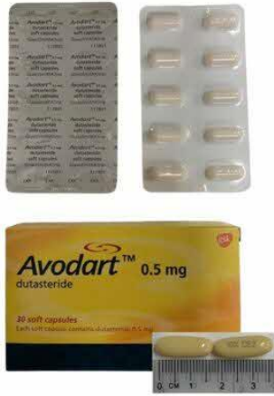
65. DUTASTERIDE 0.5MG CAP (AVODART)