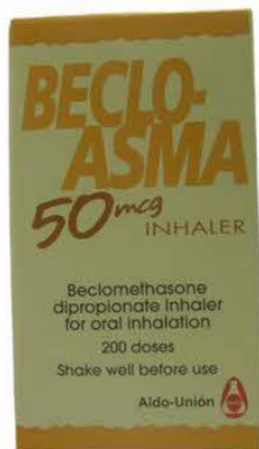
19. BECLOMET DIPR 50MCG INH 200D(BECLO-ASMA)