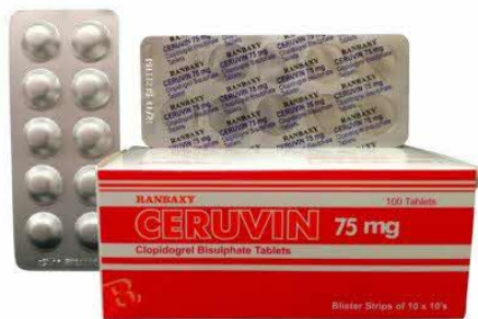
47. CLOPIDOGREL 75MG TAB (CERUVIN)