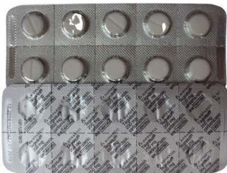
35. CARBAMAZEPINE 200MG TAB (TEGRETOL)