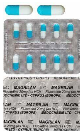
78. FLUOXETINE 20MG CAP (MAGRILAN)