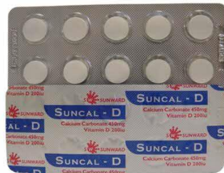
31. CALCIUM CARB450MG,VIT D 200IU TAB(SUNCAL-D)