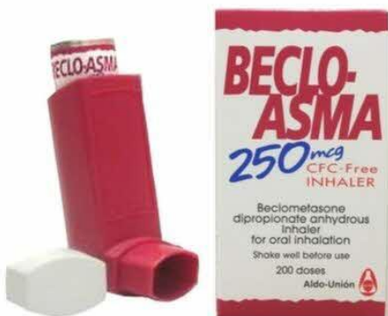
18. BECLOMET DIPR 250MCG INH 200D(BECLO-ASMA)