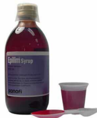
152. SOD VALPROATE 200MG5ML SYR 300ML(EPILIM)