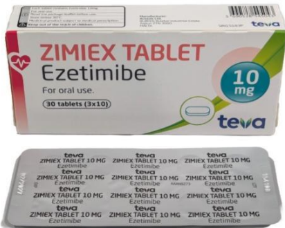
72. EZETIMIBE 10MG TAB (ZIMIEX)