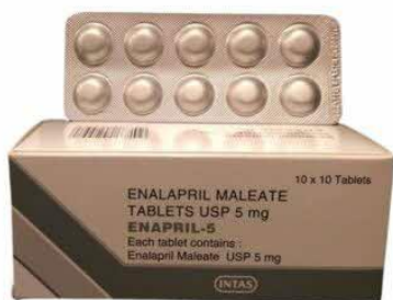
69. ENALAPRIL MALEATE 5MG TAB (ENAPRIL-5)