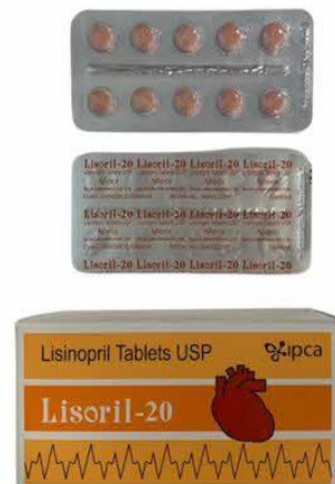
111. LISINOPRIL 20MG TAB (LISORIL 20)