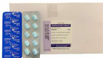
88. GLIPIZIDE 5MG TAB (SUNGLUCON)