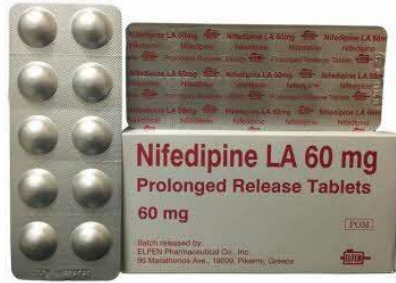
126. NIFEDIPINE 60MG LA TAB