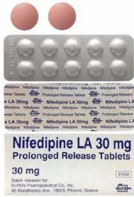
125. NIFEDIPINE 30MG LA TAB