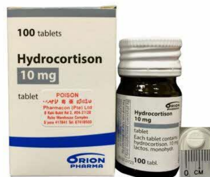
98. HYDROCORTISONE 10MG TAB (ORION)