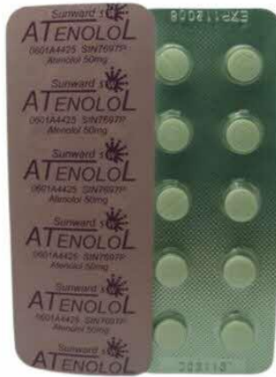
14. ATENOLOL 50MG TAB (SUNWARD)