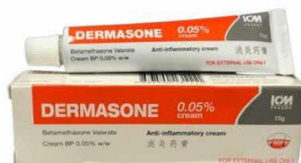
23. BETAMETHASONE VAL 0.05% CR 15G(DERMASONE)