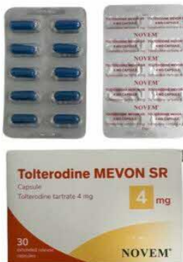
170. TOLTERODINE TARTRATE SR 4MG CAP(MEVON)