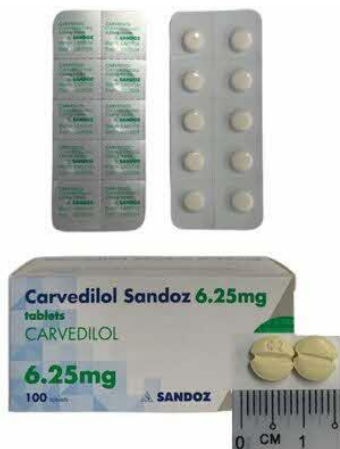
39. CARVEDILOL 6.25MG TAB (SANDOZ)