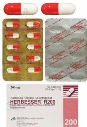
56. DILTIAZEM HCL 200MG SR CAP(HERBESSER SR)