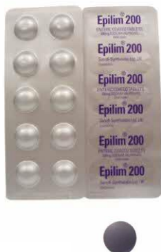
151. SOD VALPROATE 200MG TAB