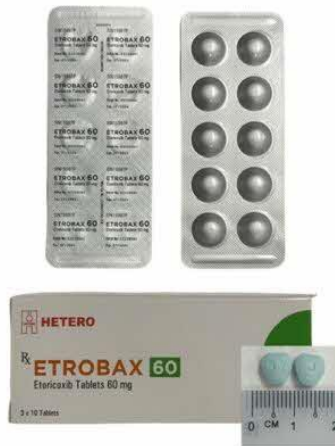
70. ETORICOXIB 60MG TAB (ETROBAX)