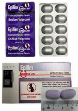
154. SOD VALPROATE 500MG CHRONO TAB (EPILIM)