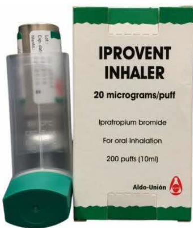
102. IPRATROPIUM BR 20MCG INH 200D (IPROVENT)