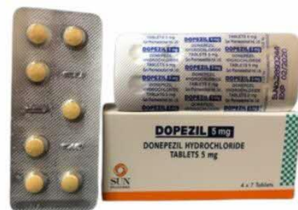
64. DONEPEZIL HCL 5MG TAB (DOPEZIL)