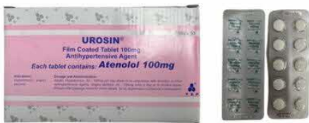
13. ATENOLOL 100MG TAB (UROSIN)