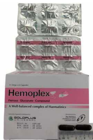
76. FERROUS GLUCONATE CO CAPSULE