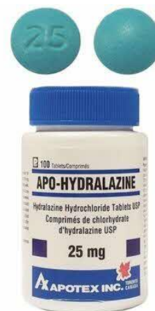
95. HYDRALAZINE HCL 25MG TAB (APO)