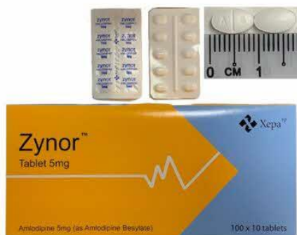
11. AMLODIPINE BESILATE 5MG TAB (ZYNOR)