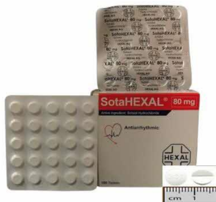
156. SOTALOL HCL 80MG TAB (SOTAHEXAL)