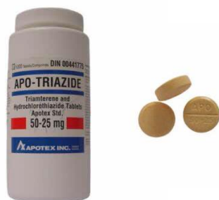
93. HCT25MG, TRIAMTERENE50MG TAB(APO- TRIAZIDE)