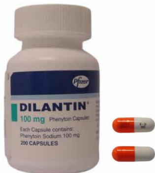
132. PHENYTOIN SOD 100MG CAP