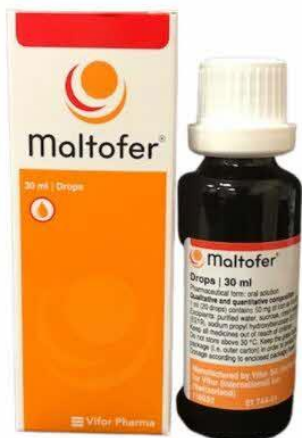
73. FE POLYMALTOSE 50MG.ML DROP30ML(MALTOFER)