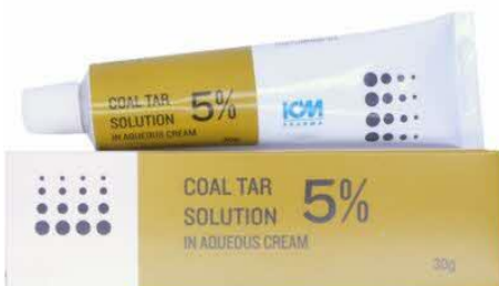
50. COAL TAR 5%, AQUEOUS CR 30G (ICM)