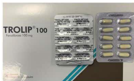
74. FENOFIBRATE 100MG CAPSULE (TROLIP)