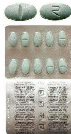
37. CARBIDOPA 25MG, LEVODOPA 250MG TAB (CREDANIL)