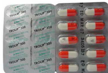
75. FENOFIBRATE 300MG CAP (TROLIP)