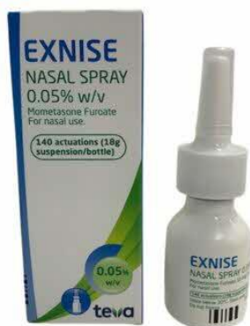
124. MOMETASONE 0.05% NASS (EXNISE) 140D