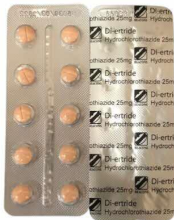
97. HYDROCHLOROTHIAZIDE 25MG TAB (DI-ERTRIDE)