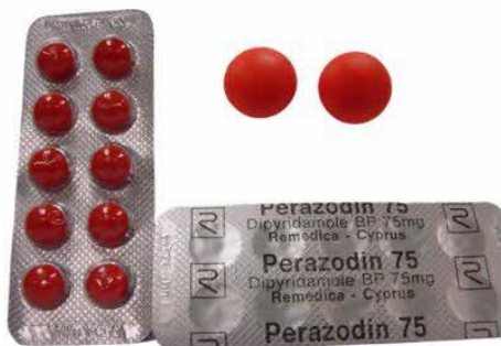
62. DIPYRIDAMOLE 75MG TAB (PERAZODIN 75)