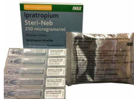
101. IPRATROPIUM BR 0.5MG.2ML INH SOLN(S-NEB)