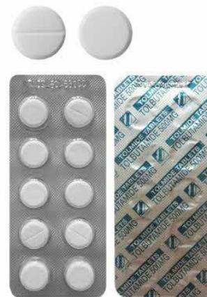
168. TOLBUTAMIDE 500MG TAB (TOLMIDE)