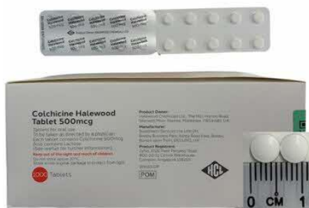
51. COLCHICINE 500MCG TAB (HALEWOOD)