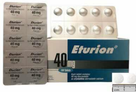
17. ATORVASTATIN 40MG TAB (ETURION)