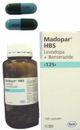
107. LEVODOPA 100MG, BENSERAZIDE 25MG HBS CAP