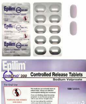
150. SOD VALPROATE 200MG CHRONO TAB (EPILIM)