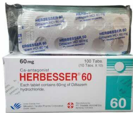
58. DILTIAZEM HCL 60MG TAB (HERBESSER)