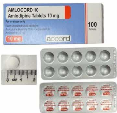
10. AMLODIPINE BESILATE 10MG TAB(AMLOCORD)