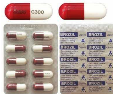
86. GEMFIBROZIL 300MG CAP (BROZIL)