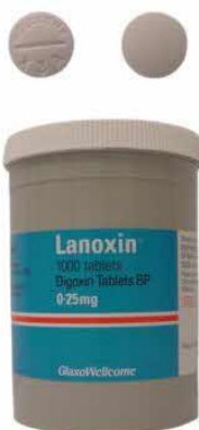
54. DIGOXIN 250MCG TAB (LANOXIN)