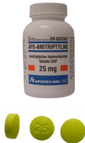
9. AMITRIPTYLINE HCL 25MG TAB(APO)