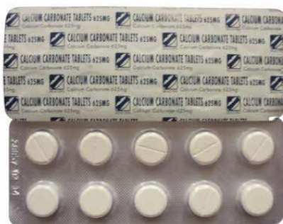
33. CALCIUM CARBONATE 625MG TAB