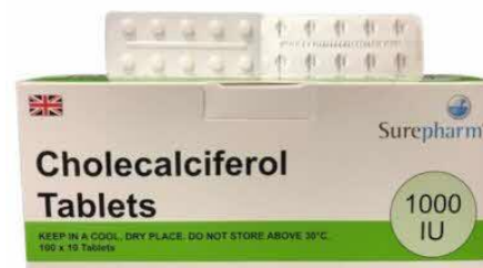
52. COLECALCIFEROL (VIT D3) 1,000UNIT TAB