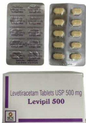
106. LEVETIRACETAM 500MG TABLET (LEVIPIIL)