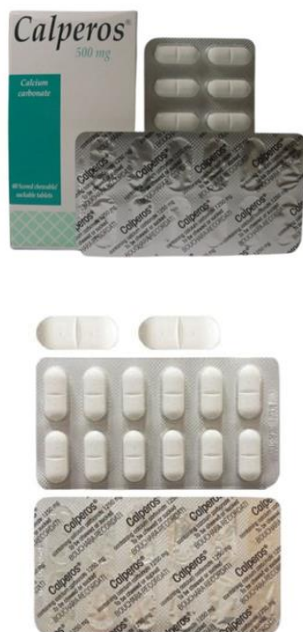
32. CALCIUM CARBONATE 1.25G CHEW TAB(CALPEROS)